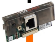
pCOWEB SE CAREL

RUT100 is the autoinstalling kit, supplied by Climaset srl, for safely connecting the pCOWeb (through a VPN encrypted connection ) to the customer router and then to the Plantgate CLOUD, no configuration is needed on customer router.