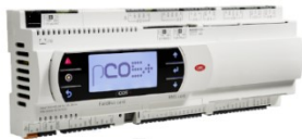
CAREL pCO controller

pCOWeb is a webserver, supplied by Climaset srl, that is to be installed into the BMS card slot of the system's pCO controller. Thanks to its intuitive webpages, the user can very easily see and change parameters of the residential system.